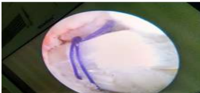
Figure 1. ACL reconstruction intraoperative image

A diagnostic arthroscopy was performed and a full assessment of all intra-articular structures was performed. Those having meniscal tears were treated surgically by partial meniscectomy prior to reconstruction and the ACL stump was shaved off next. The femoral insertion site is at the 2 o'clock position on a left knee and the 10-o'clock position on a right knee. The knee was hyper-flexed to 120 degrees for better visualization and passing the guide wire which was then drilled and came out from lateral aspect of thigh piercing both the cortices. The elbow ACL tibial guide was set to an angle of 55° and placed in the center of the remaining tibial stump of the native ACL through the medial portal. The free edge of the anterior horn of the lateral meniscus, center of medial and lateral tibial spines and point 5mm to 7mm anterior to PCL was often used as the aimer point. Femoral side was fixed with either interference screw or endobutton and tensioning of the graft was achieved by cycling the knee around 20 times from 0 to 90°. Tibial side was fixed with interference screws in all cases while tensioning the graft and giving posterior drawer at the same time. (Fig. 1.)