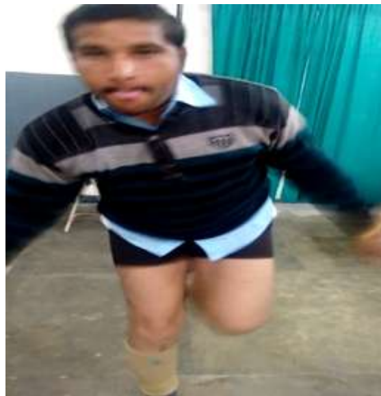
Figure 4. Single Leg Hop Test

Mean value of Single leg hop test (Fig. 4) improved from 21.96 \pm 10 preoperatively to 69.1 \pm 12.8 at the time of follow up and is found to be significant ( p < 0.05 )